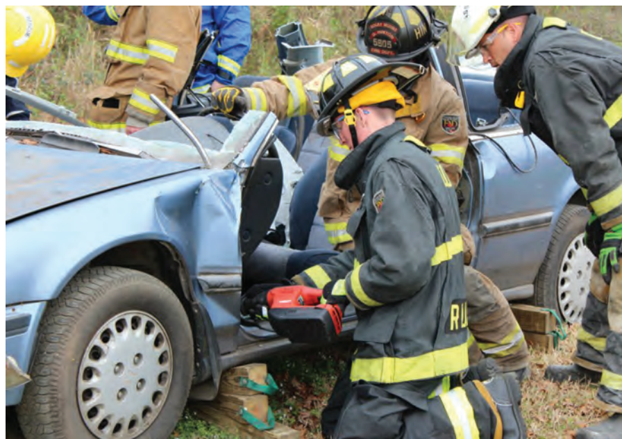
Students learn how to dismantle a wrecked vehicle using a variety of different tools so trapped patients can be removed safely and quickly.

"There's a brotherhood in public safety. If we don't take care of each other, people can get hurt."