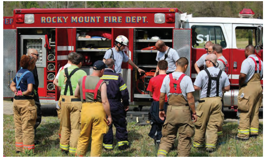
Edgecombe instructors introduce the basic concepts of modern technical rescue equipment to students from across North Carolina, with the assistance of the Rocky Mount Fire Department.