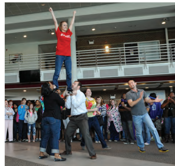
Mobley Atrium was the site of a flash mob in March. The event kicked off the 45th anniversary celebration of the founding of Edgecombe Community College, which was established on October 5, 1967.

Anniversary events will include the dedication of a new wetlands trail on the Tarboro campus, the dedication of a book on the history of the